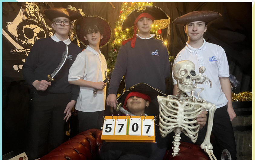
Pirate Escape Room