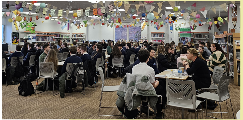
Speed Networking Event