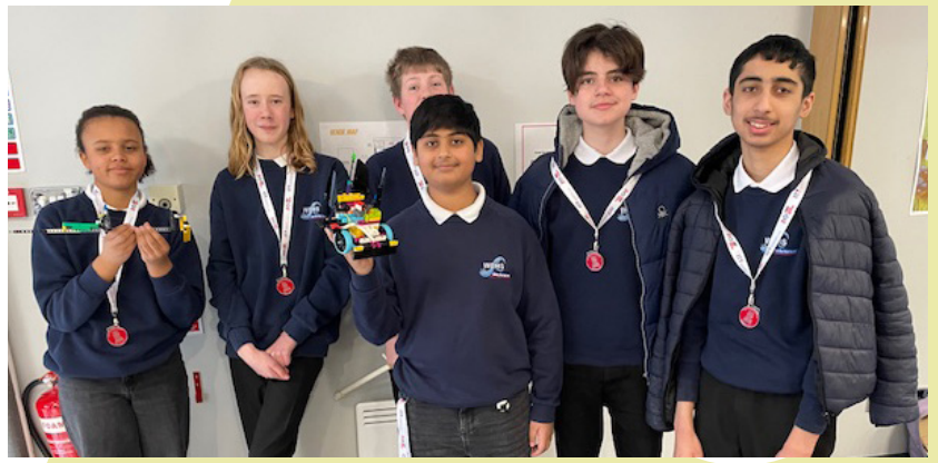
Lego League Competition

"A highlight this term was Maths Fest. I particularly enjoyed Maths with Music where we were looking at the maths of making beats."