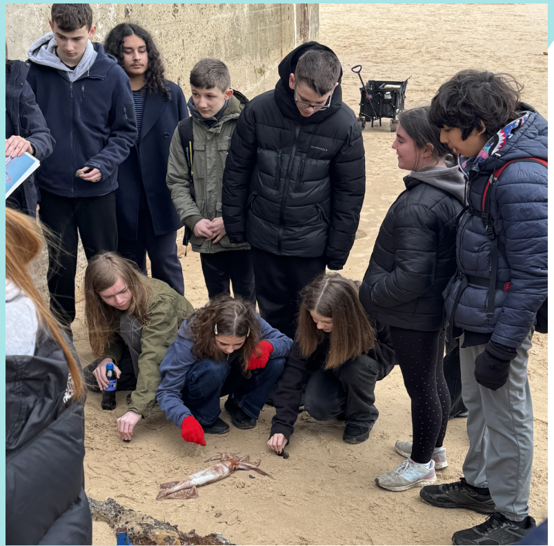
Cullercoats Dove Marine Visit

So far this academic year the Student School Council has met each half term to discuss such diverse topics as school uniform, wellbeing, extracurricular offerings and how diversity is represented in our school wide curriculum. We value and appreciate all student feedback and so far this year this suggestions and views shared with us have been able to enact some genuine change. As we move through to the summer term the school council will be looking at some charity initiatives they want to support and sharing their ideas and suggestions as we prepare for the next academic year. For those who are regularly attending, there will also be some opportunities to attend some invited events and hear from outside speakers. The school council meetings take place on the last Wednesday of every half term during extended registration - keep an eye out during TFTW and on the bulletin notices to get involved!