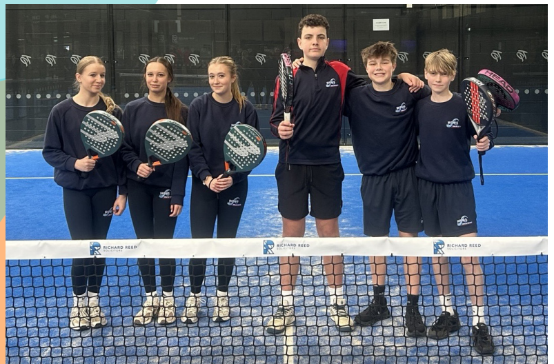
Yr 9 Regional Padel Competition

Whitley Bay High School Deneholm Whitley Bay NE25 9AS 0191 7317070 www.whitleybayhighschool.org