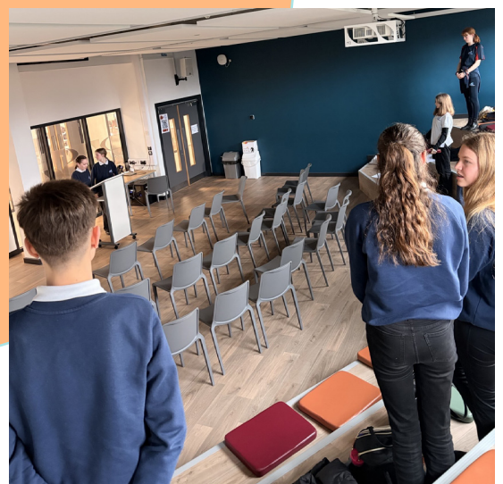
Mock Trial Rehearsals

You can follow us on Instagram: @whitleybayhigh