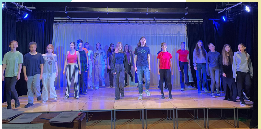
Performance Art Rehearsal